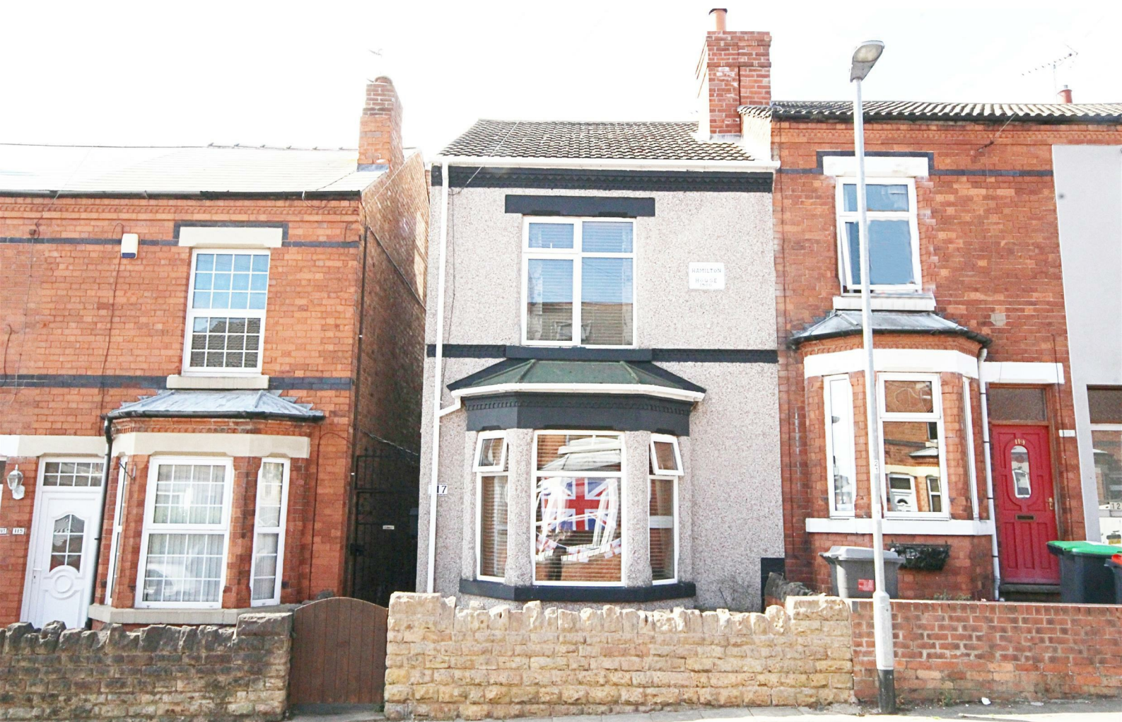
Derbyshire Lane, Hucknall, Nottinghamshire NG15 7GF